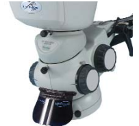
Fixed angle viewer