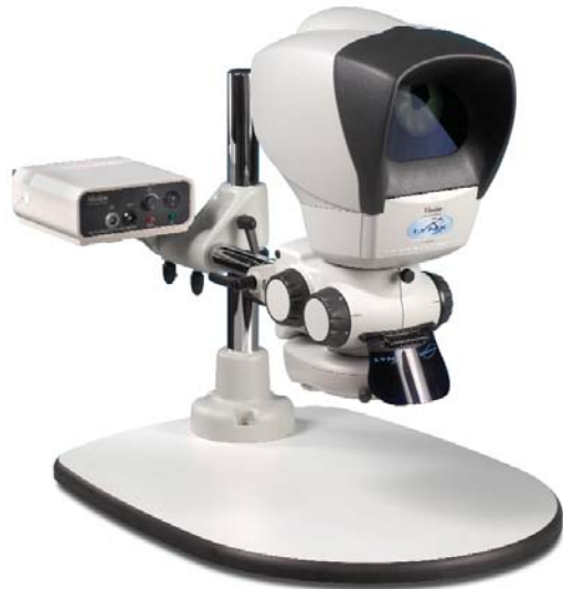
Lynx, with swing away boom mount, for flexibility and ease of use.

Lynx is used in a wide range of industry applications including general manufacturing, medical devices, electronics, precision engineering, plastics and rubber. The multiple accessories available for the Lynx enable a wide variety of tasks including inspection, manipulation, assembly, dissection, soldering, polishing, finishing and measurement.