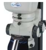
Step magnification multiplier