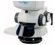
Oblique and direct viewer