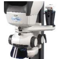
Image capture and archive