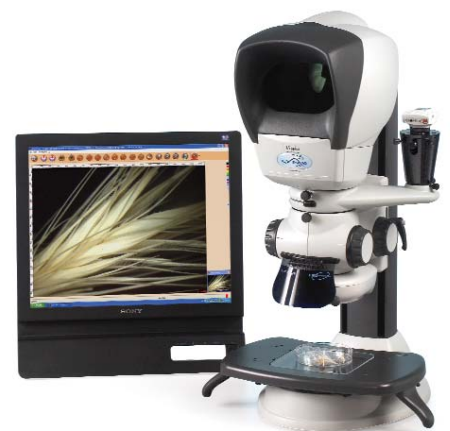
Lynx bench stand with optional image capture accessory and floating stage