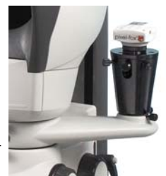
Image capture and archive