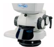
Oblique and direct viewer