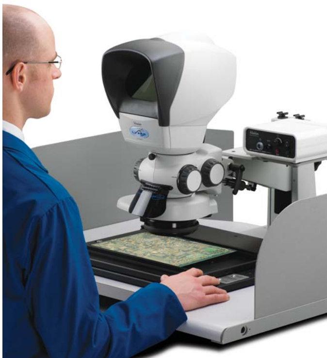
Oblique and direct viewer allows a 34° from vertical view, which can be rotated through 360° for superb stereo view of 3-dimensional subjects.

Lynx VS8 is a variant of Vision Engineering's Lynx stereo microscope. Lynx utilises Vision Engineering's patented Dynascope™ technology to offer the user advanced ergonomics by removing the need for restrictive eyepieces. Lynx VS8 is in use in tens of thousands of PCB manufacturing sites worldwide and provides optimum ergonomics to reduce fatigue, increase operator accuracy and reduce scrap.