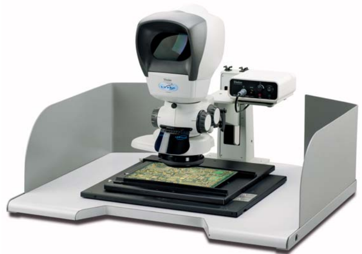
Lynx VS8 with patented eyepieceless optics for specialist PCB inspection.