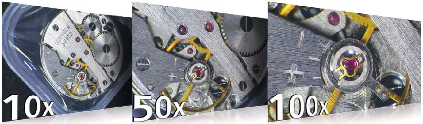
With an exceptionally large field of view, Makrolite II can view whole samples. Then simply zoom in without changing focus for detailed inspection. Magnification from 10x to 100x with the DCR250 lens.