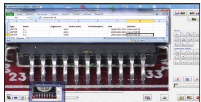
...with the option to annotate, measure, & export data to Excel for reporting.