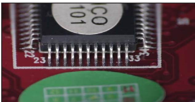
Inspect with optimum clarity and contrast...